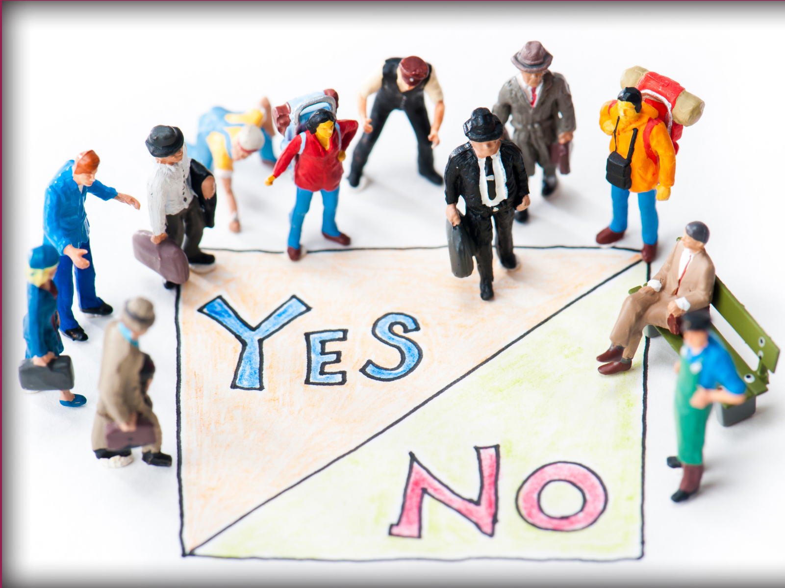
Image: Miniature people standing around a drawing of a square split into halves. One half says “yes” and one says “no.”

“Not making a decision means forgoing an opportunity.