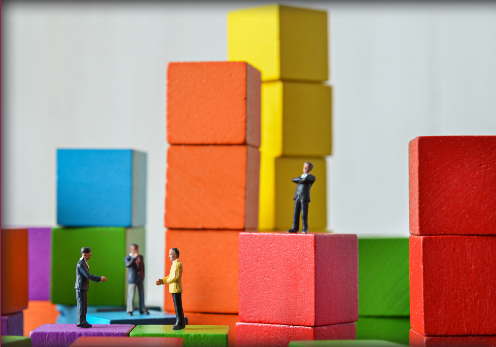
Image: Miniature people standing on towers of colorful building blocks.

“Education is our passport to the future, for tomorrow belongs to the people who prepare for it today.