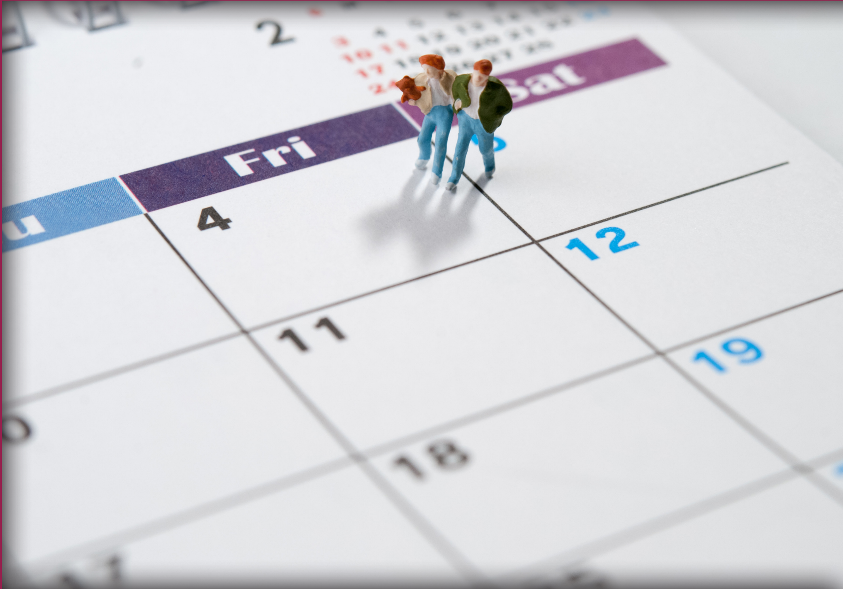
Image: Two miniature people walking across a monthly calendar.