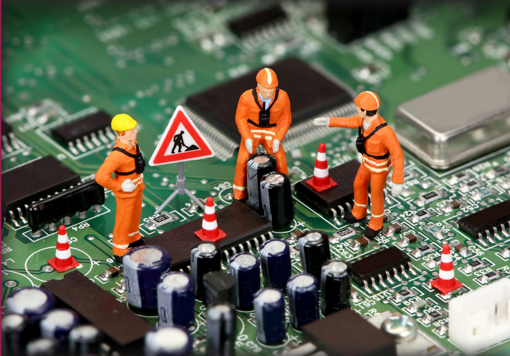
Image: Three miniature construction workers working on a computer motherboard.

“We go through our careers and things happen to us. Those experiences made me what I am.