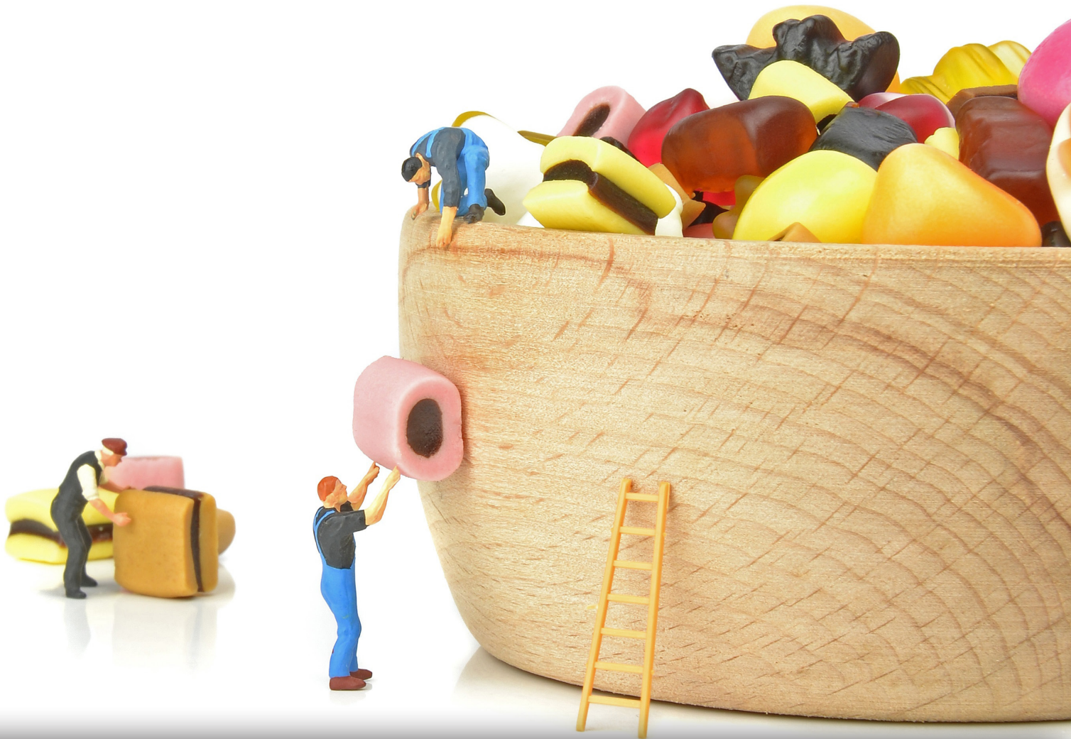
Image: Miniature people work together to fill up a giant bowl with candy.

“You can do anything as long as you have the passion, the drive, the focus, and the support.”