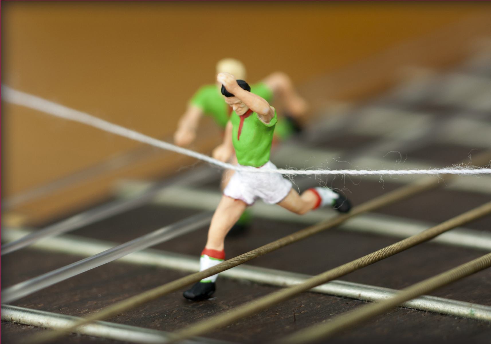
Image: A miniature person crossing a string finish line on a running track. The track is a close-up guitar neck.

“The only person you are destined to become is the person you decide to be.