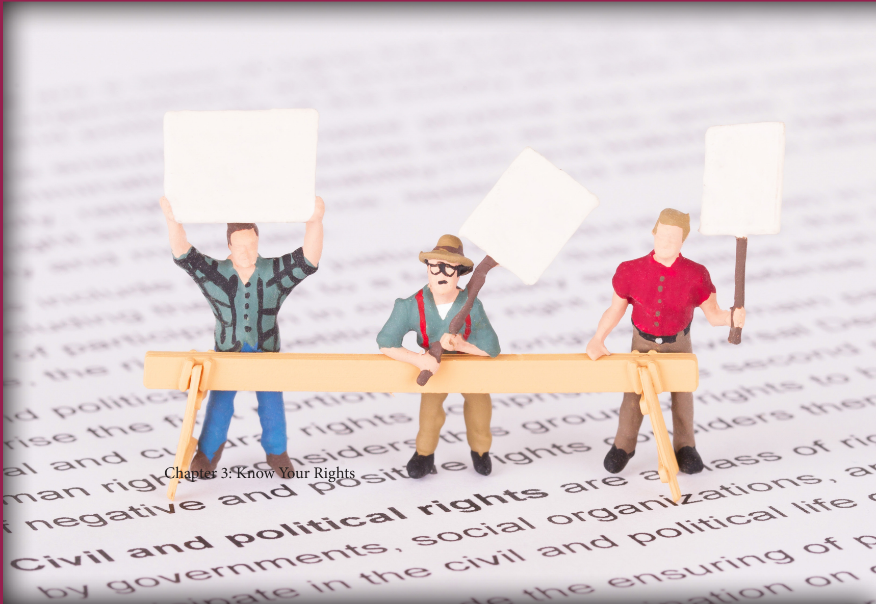
Chapter 3: Know Your Rights

Image: Three miniature people holding signs. They are standing on a page that says "civil and political rights."