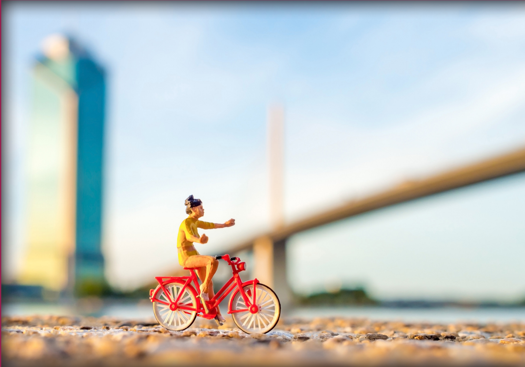
Image: A miniature person riding a bicycle through a city without using their hands.

“Independent living is not doing things by yourself. It is being in control of how things are done.